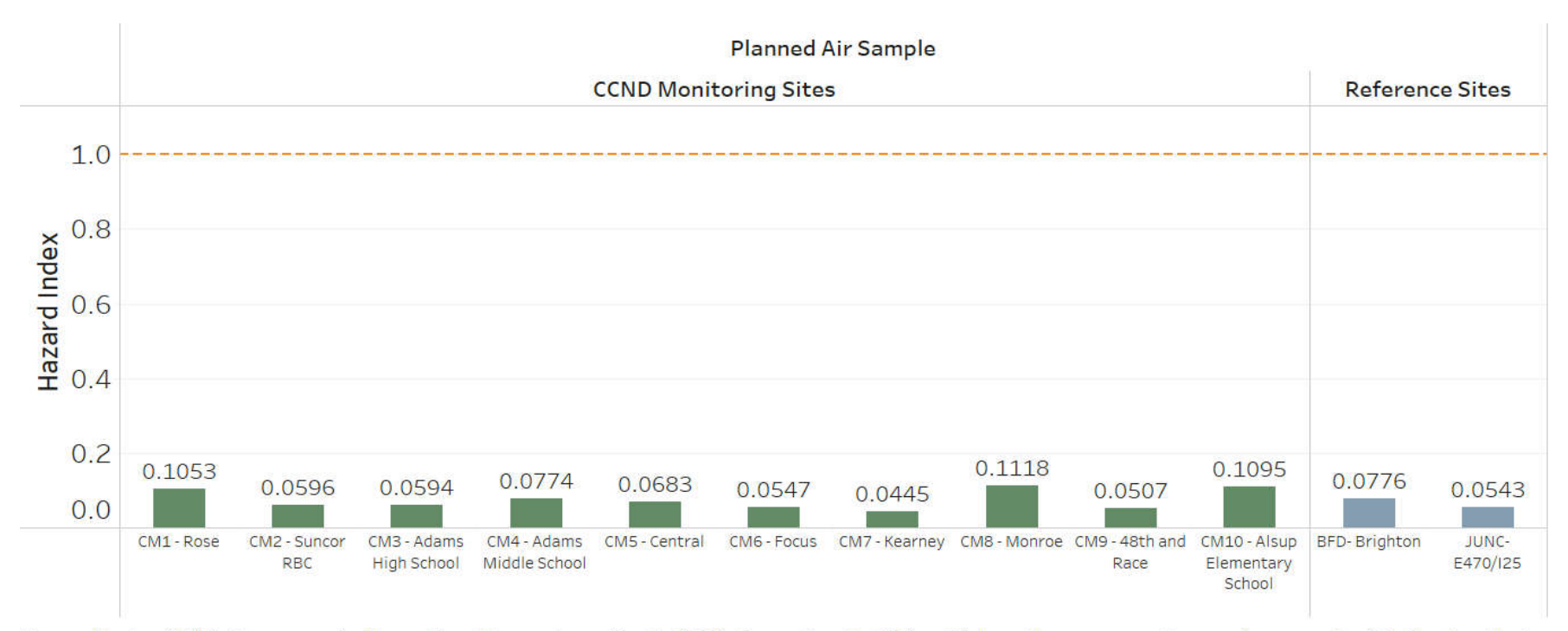
FIGURE 1-3 NOVEMBER 2, 2023 (Q4) - HAZARD INDEX BY AIR SAMPLING LOCATION FOR ALL PLANNED AIR SAMPLES

Hazard Index (HI) is the sum of all combined hazard quotients (HQ). According to EPA, a HI less than or equal to one (orange line) indicates that exposures are likely to be without any appreciable risk of adverse acute health effects, even for sensitive sub-populations.